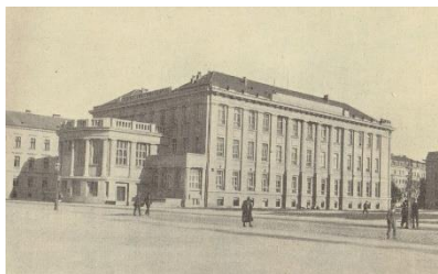
Building at Marulićev trg 19, Zagreb, where the founding meeting was held