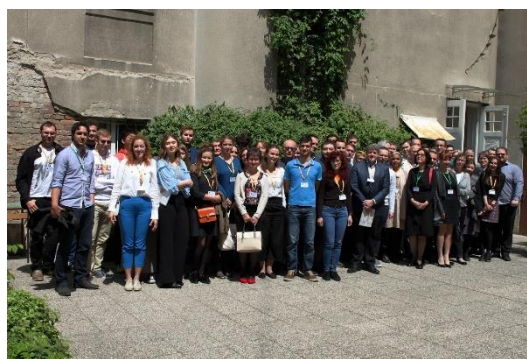
Participants of the CCD meetings in 2018 and 2019